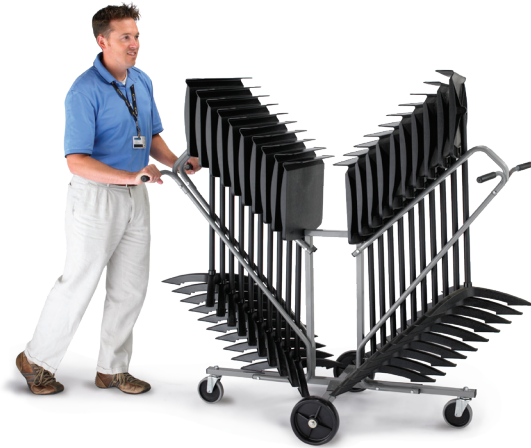
Even fully loaded, the Large Cart is easy to handle and the heavy-duty construction means a smooth, solid ride.