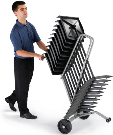
The Small Move & Store Cart is designed to tilt back smoothly and safely, allowing one person to handle a full load with ease.